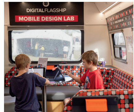
Mobile STEM classroom in Ohio

NREDA member organizations believe that rural development efforts should be accessible, welcoming, and supportive of individuals from all walks of life. An assorted workforce can tap talents from across a range of experience to create a strong and productive workforce. It is crucial to implement programs that create training and educational opportunities to meet new, local, and global economic demands.