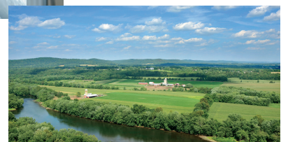
Development in Pennsylvania