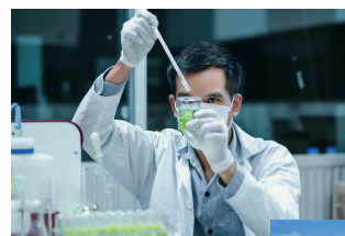
Healthcare research in Minnesota

We want them to ask, 'How can I use this to create something new or solve a problem in my community?'